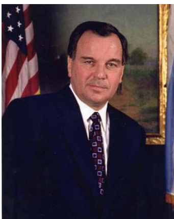
RICHARD M. DALEY MAYOR