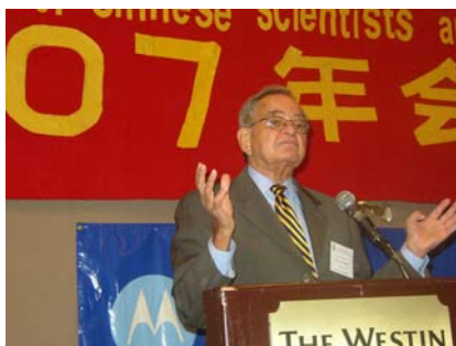
Mr Leo Melamed, Chairman Emeritus CME Group