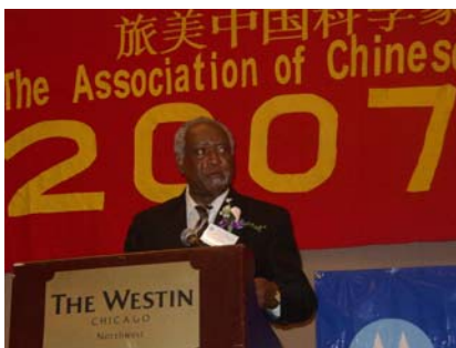
US Congressman Danny Davis在年会上